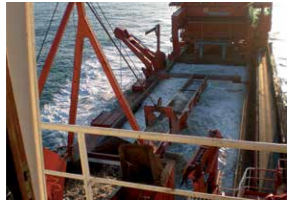
Aggregate dredger Arco Dart

Hanson Aggregates produces sand, gravel and crushed rock from over 70 quarries, depots and wharves in England and Wales, which includes Hanson Aggregates Marine, Europe's largest producer of marine-dredged sand and gravel.