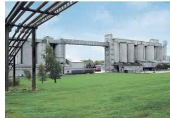
Ketton cement works in Rutland

Hanson Cement is a leading manufacturer of Portland Cement, both in bulk and in bags, and produces ground granulated blastfurnace slag (GGBS) under the brand name Regen – a cement replacement in ready-mixed and precast concrete – and a range of bagged cementitious and aggregate products.