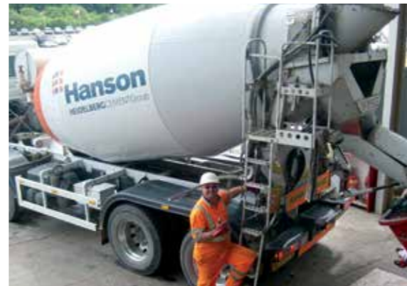
Ready-mixed concrete delivery