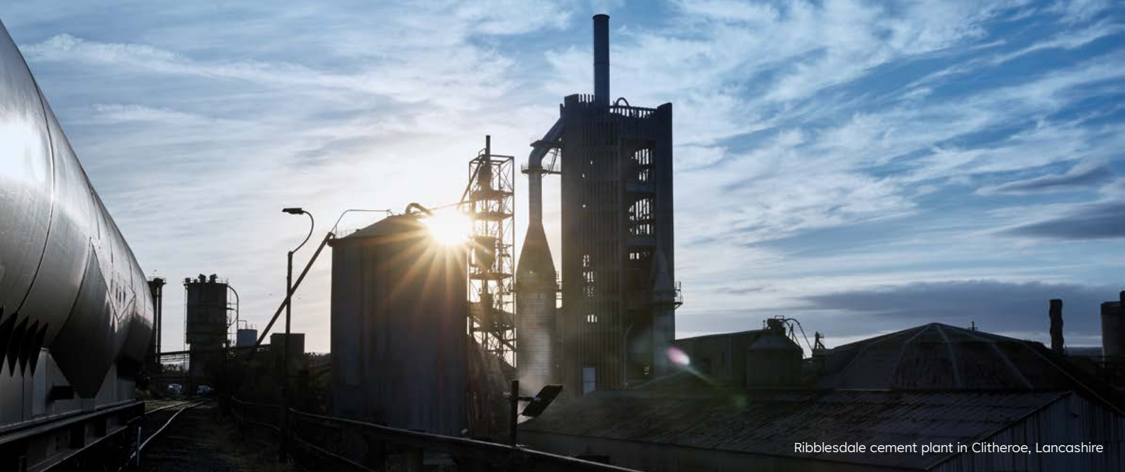
Ribblesdale cement plant in Clitheroe, Lancashire