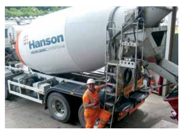
Ready-mixed concrete delivery