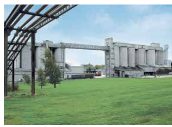
Ketton cement works in Rutland